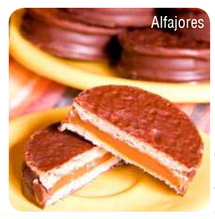
nma Serrano Esparza

They are the famous round, cookie type sandwiches layered with dulce de leche or fruit preserves, dipped or coated in chocolate or sugar. They are absolutely 'yummy' and are Argentina's answer to the candy bar.