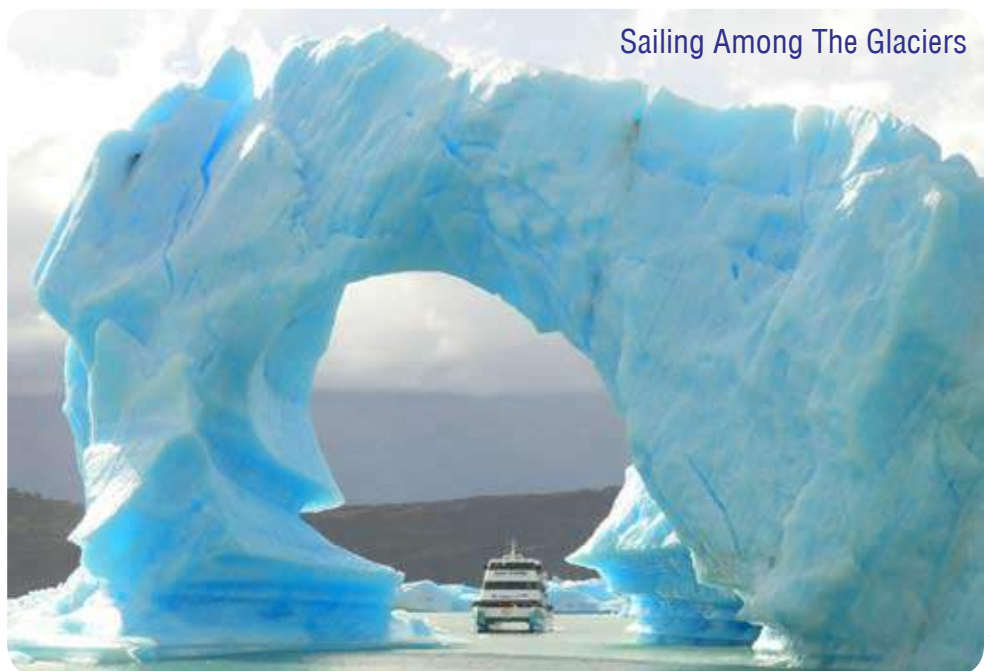
Sailing Among The Glaciers

Tours to other glaciers are also available from El Calafate.