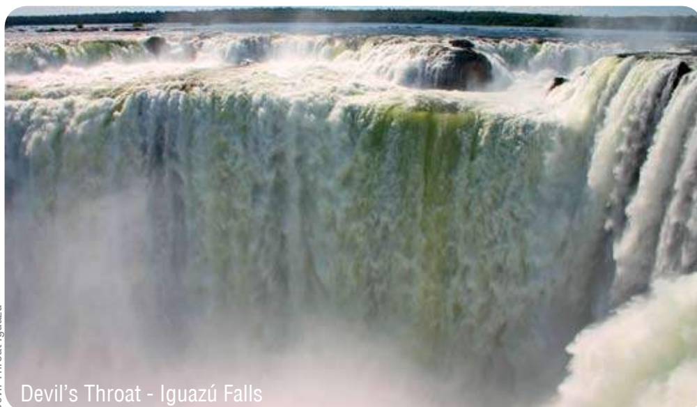
Devil's Throat - Iguazú Falls

A visit to the Iguazú falls is also possible during full moon clear nights, normally for five consecutive nights a month; these guided walks allows visitors access to the Garganta del Diablo (Devils Throat) and enjoy the falls during the night-time. Most hotels in Puerto Iguazú can book this for the guests.