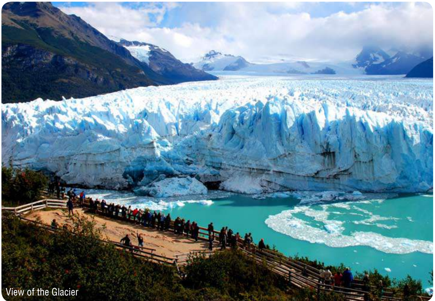
View of the Glacier