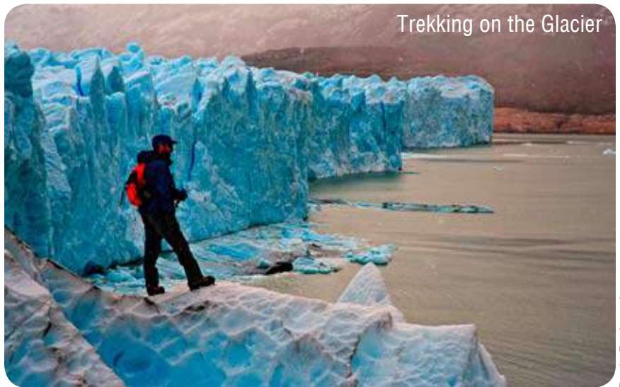
Trekking on the Glacier

After reaching the opposite shore, one disembarks from the boat, where specialized mountain guides welcome the guests. Groups for the mini trek are formed. Crampons (special metal spikes worn on boots) are provided for better traction. Then the adventure begins with a fascinating 2-hour journey across the glacier. The trek introduces guests to enjoy the fascinating landscape of the glaciers, streams, small lagoons, gullies, crevasses and plenty of ice formations. The intensity of the trekking is moderate.