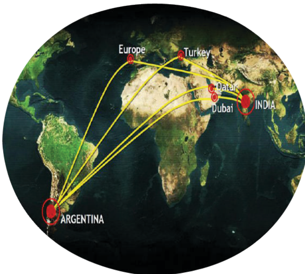
The Way To Get There