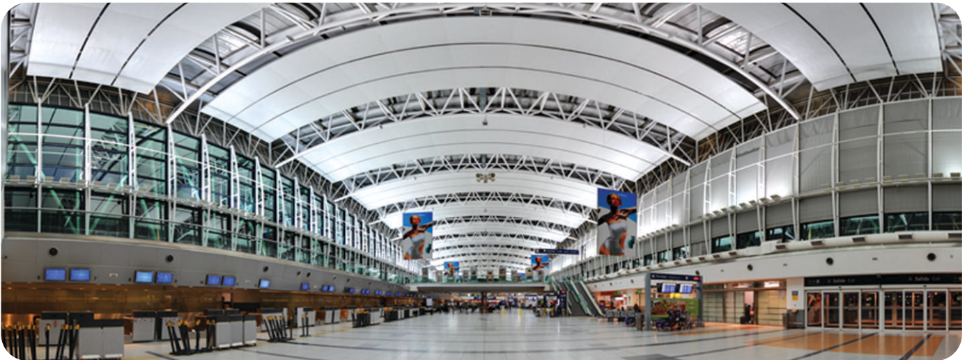
International Airport Ezeiza (EZE)